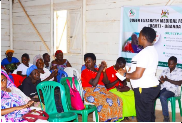
HAPPY BITRESS faciitaining the second session at QEMF offince