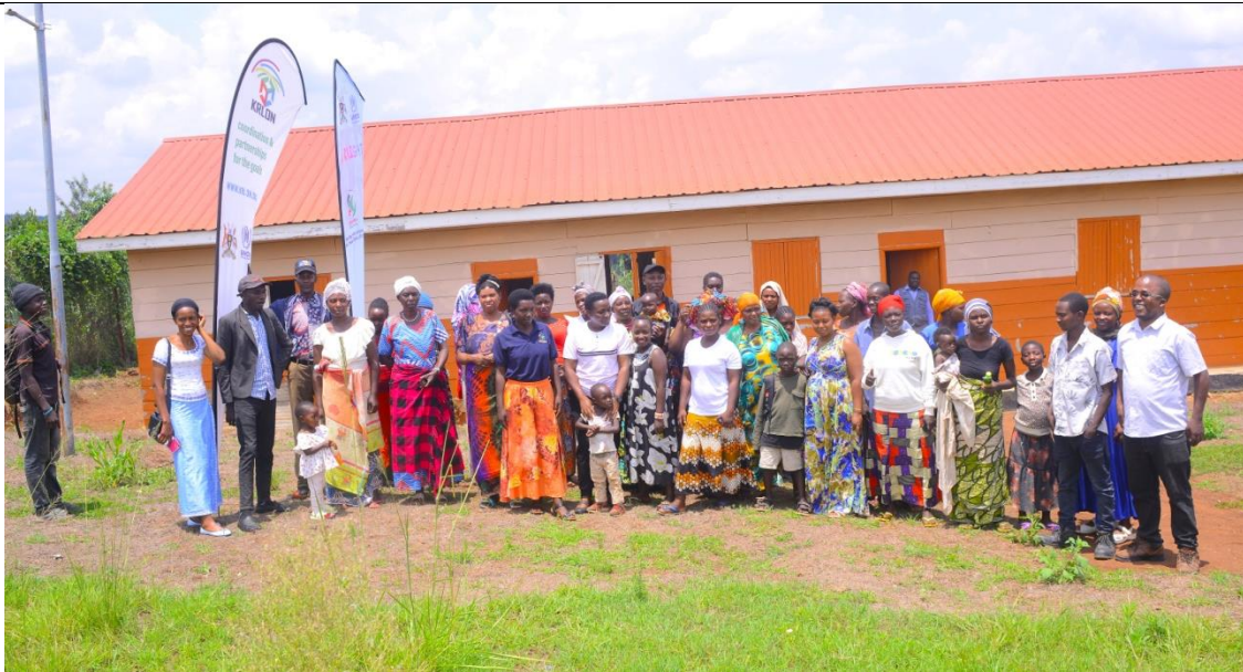
the image above shows the participants and facilitators after the meeting