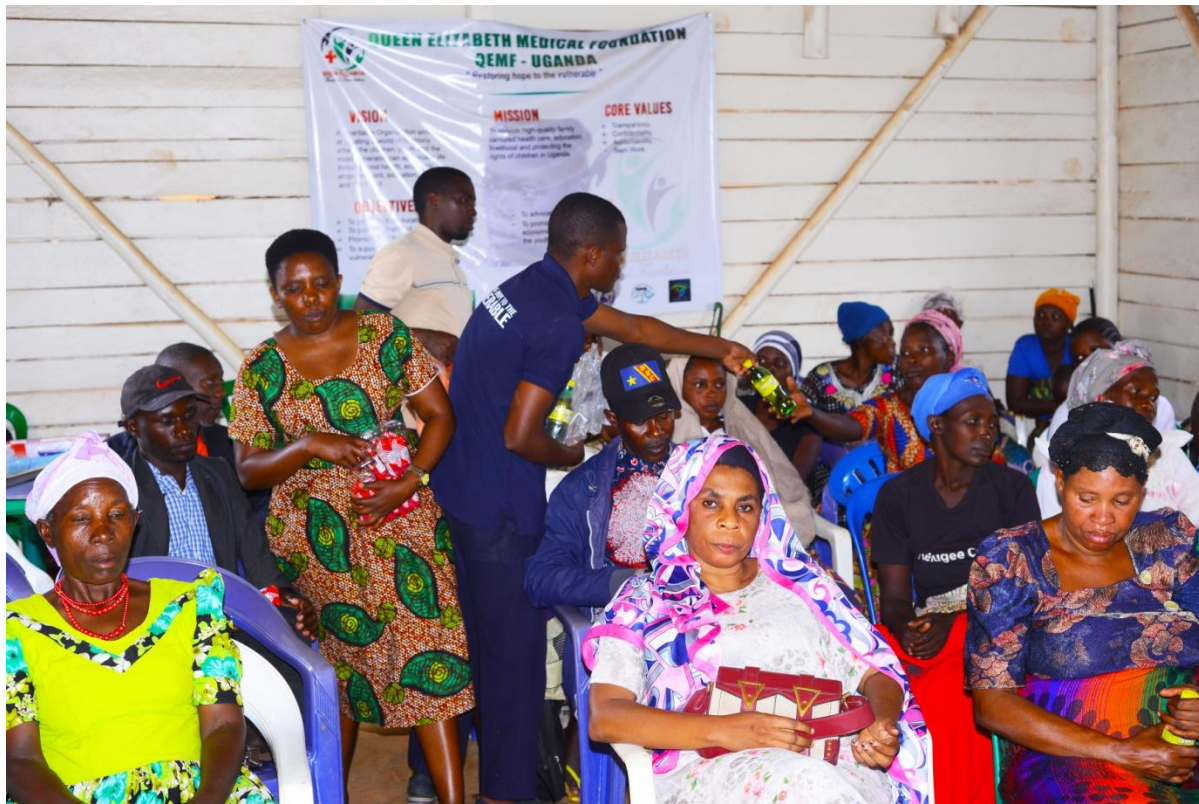
The image above shows QEMF community volunteers supporting in distribution of refreshments to the participants during the meeting