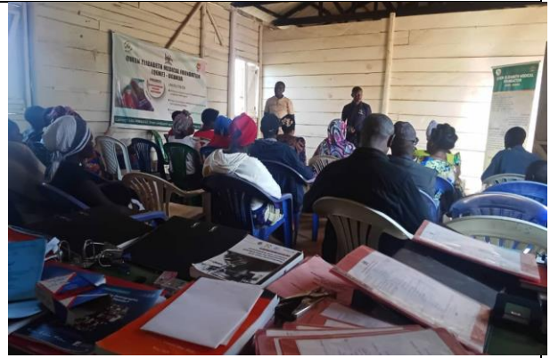
The images above shows the participants receiving administrative communication from the CEO for QEMF