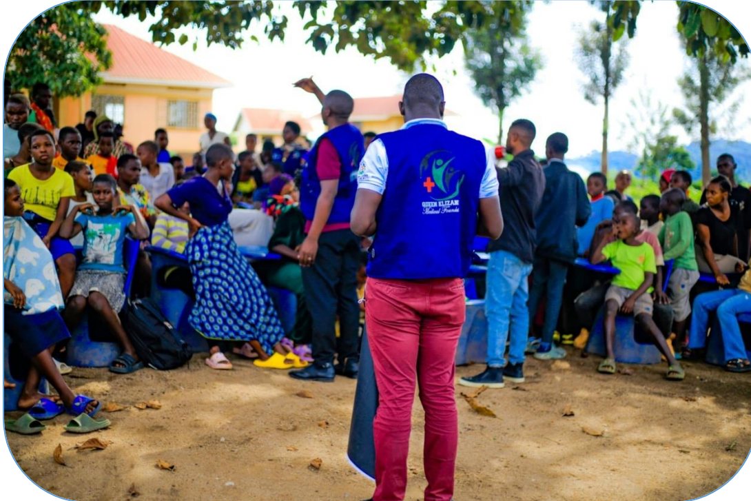
The image above shows QEMF staff organising the participants to get ready for the drama session