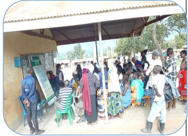
Dialogue with caretakers on child projection in Bukere