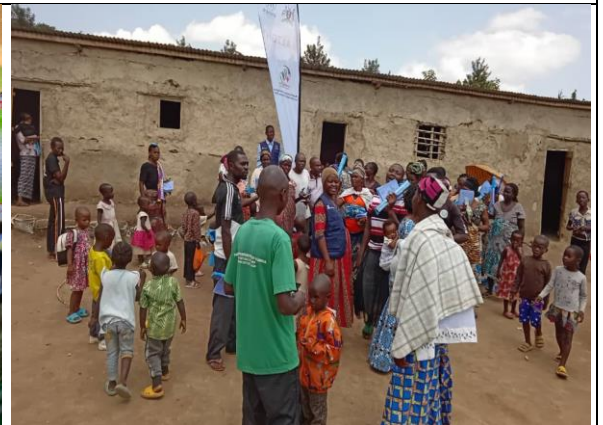
Group discussion with thw care takers on child protection