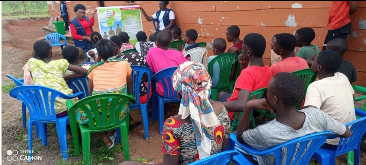
The image above shows HIV Prevention awareness session conducted on 25 th Sep 2024 in DAM I village