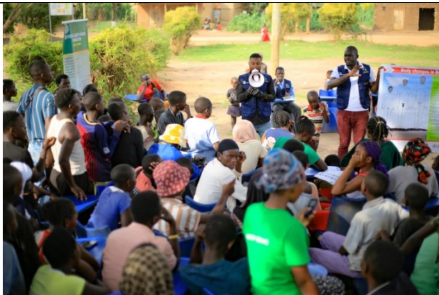
HIV awareses campaig in KITONZI viallange