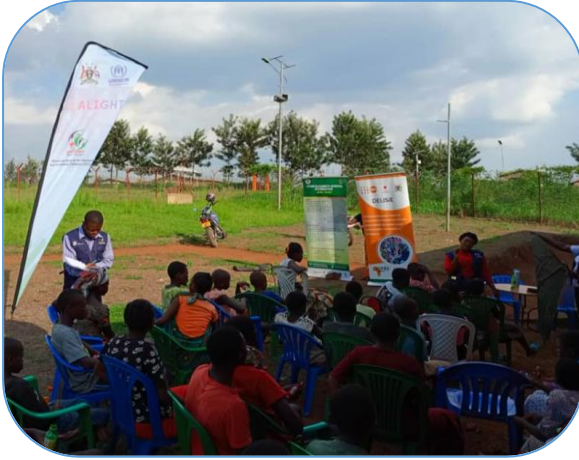
group discussin for only women in the reproductive age in DAM I