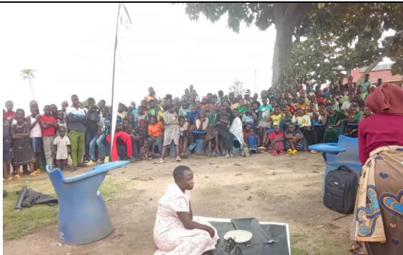
The image above shows the drama group presenting a play about how child abuse and domestic violence can lead to HIV aquision